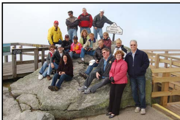
Everyone gathers for at group shot at the 4867 foot summit of Whiteface Mountain.