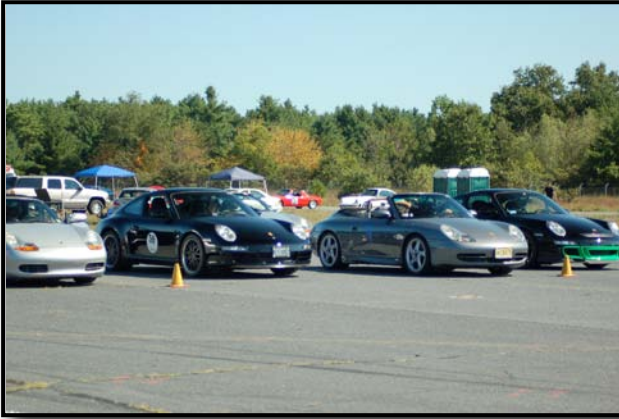
Cars being staged for their next run.