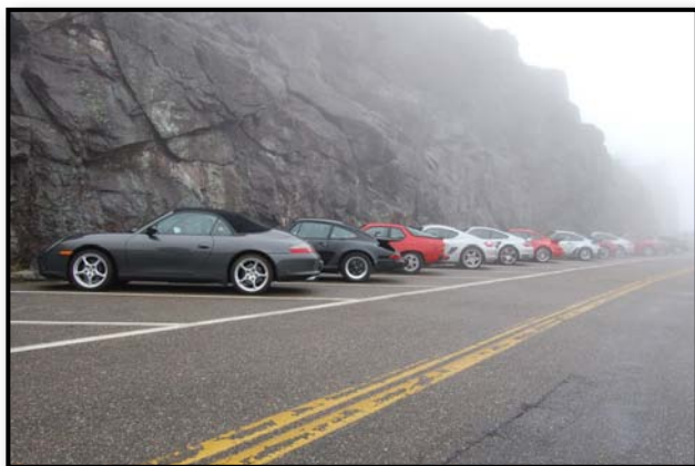
Once we arrived at the top of Whiteface Mountain the morning fog started to lift.