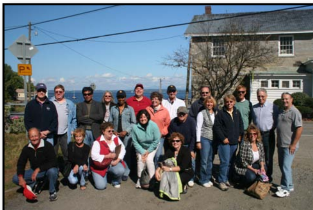
Member gather outside the Old Dock Side Restaurant after lunch on Sunday.