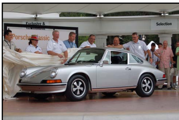
The unveiling of the 911T, that was restored by Porsche Classic.

PCNA had many Porsches on display, but the new GT3 RS 4.0 was a favorite.