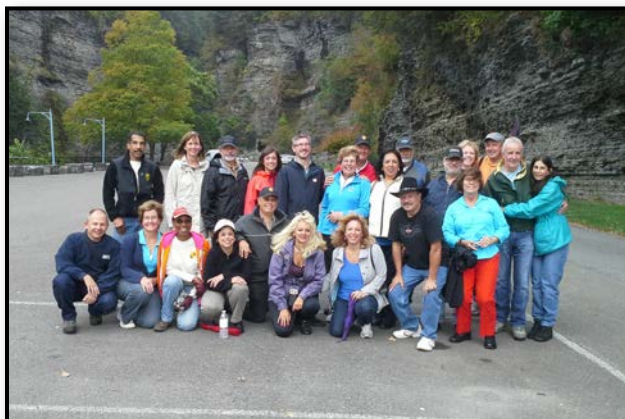
Everyone had a wonderful weekend touring the Finger Lakes region of NY.