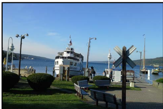
The view of beautiful Seneca Lake.

Members are lined up ready to for their parade lap of Watkins Glen.