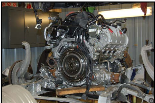
The power plant from a Panamara has been dropped for repair.