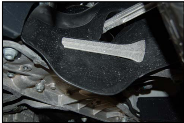
The front brake cooling duct from the new C4S.