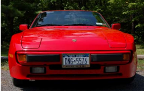
Al Thompson's 1985 944 is ready to be judged.