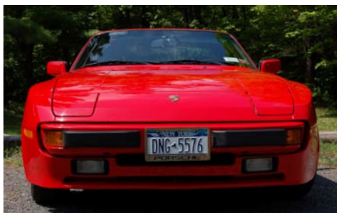
Al Thompson's 1985 944 is ready to be judged.