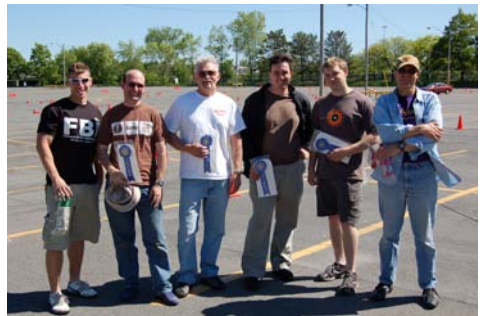
The class winners for the Spring Autocross.