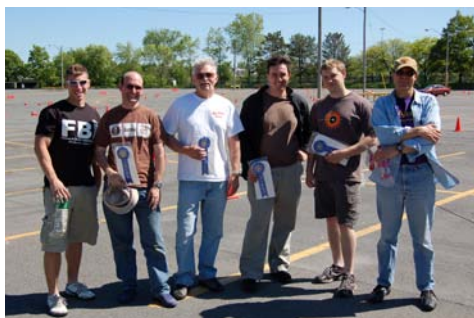
The class winners for the Spring Autocross.