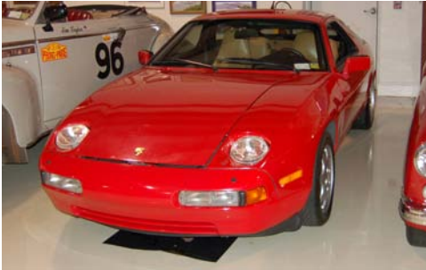
The only Porsche in the whole collection.