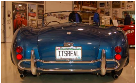
The plate says it all.