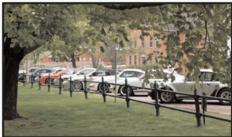
Porsches parked around the green in Weston, VT.