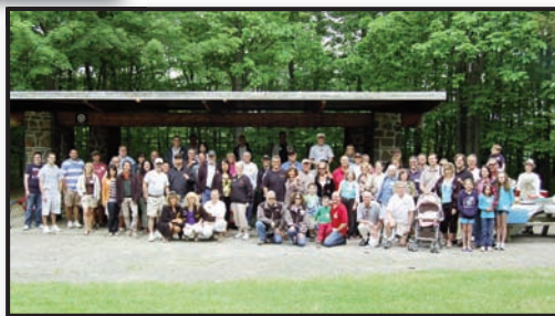
We had 75 members in attendance at this year's Picnic.