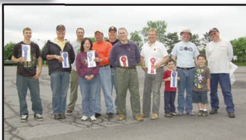
The winners at this year's Spring Autocross.