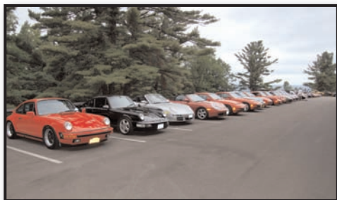
The largest turn out of cars for the concours in recent history.