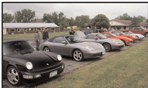
We arrive at the Erie Canal Village in Rome, NY.