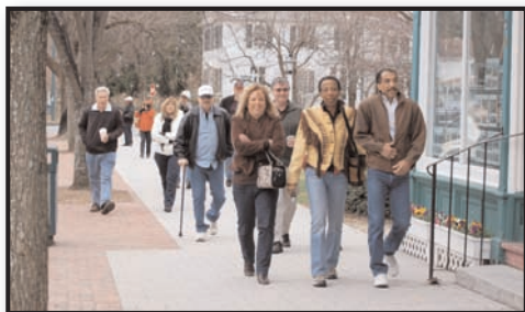
Members stroll down the streets of Stockbridge on the way to the Red Lion Inn for lunch.