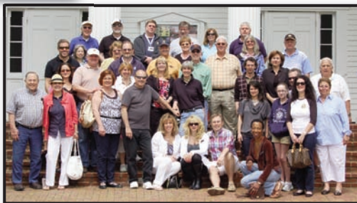
Members enjoyed a great drive through, NY, MA, and VT.