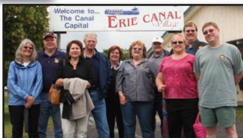
Despite a few showers and overcast skies, members enjoyed their visit.