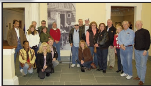
Everyone enjoyed the tour of the Norman Rockwell Museum.