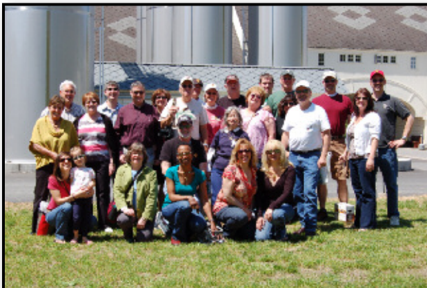
Great weather made for a fantastic day in Cooperstown, NY.