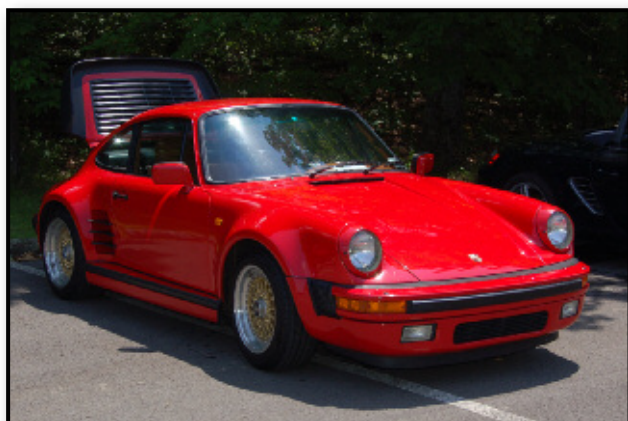
Steve Montano's beautiful 930, on display during the concourse.

Members enjoyed a delicious picnic lunch with all the fixins.