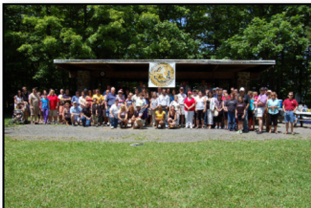
The attendance at our Annual Picnic continues to grow with close to 100 members attending.