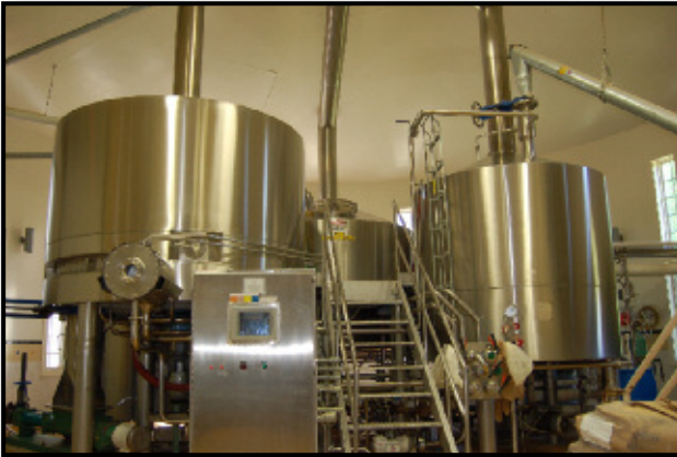
A look at the Millhouse in the Brewery Ommegang.