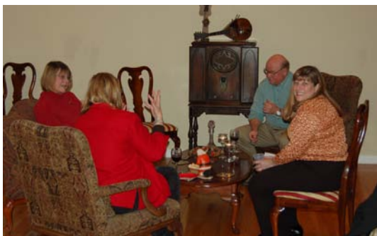
Club Members Sit and Enjoy the Various Wine and Cheeses.