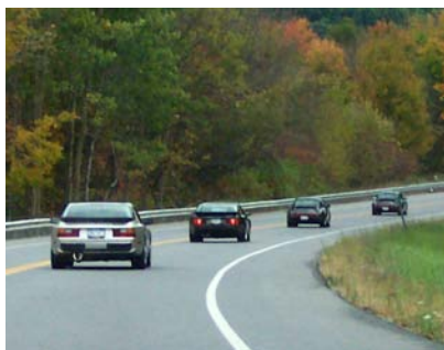
A Beautiful Drive Through the Mountains of Vermont