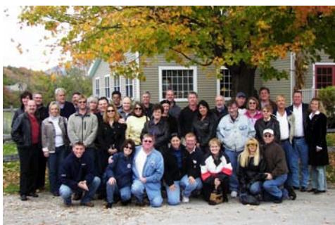
Members Gather For a Photo Outside the Inn at Willow Pond.