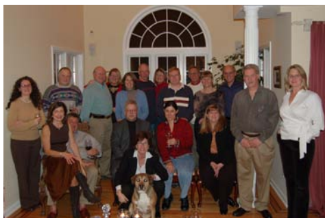
Despite the Bad Weather We Still Had a Great Turnout.