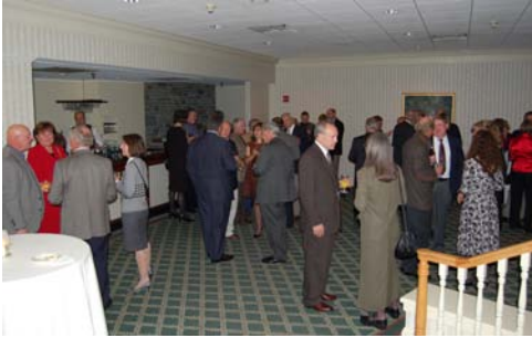
Members Gather for the Cocktail Hour Before Dinner.