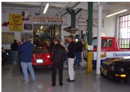
Along the Way We Stopped at Hemmings Motor News in Bennington.