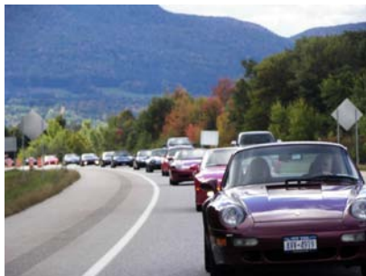
On Our Way to Vermont.