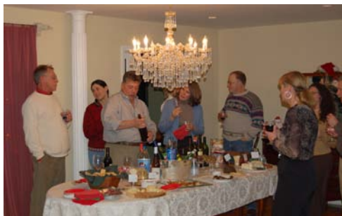
Our Host Uncorks Another Bottle.