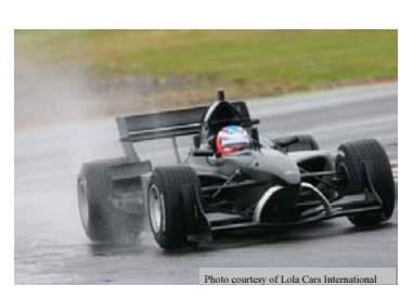
Current supplier to LOLA CARS INTERNATIONAL